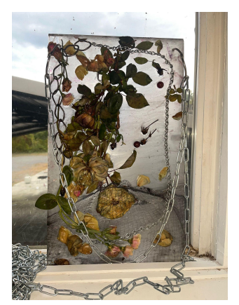
Window Flora, chain, resin, found objects on plexi $499

The Language of Devotion Flora, chain, resin, sumi ink, found objects on plexi $799