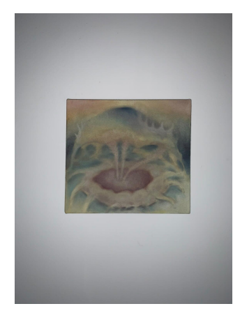
Untitled 2, Oil on canvas, $385