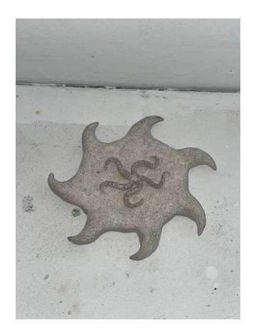
Créature, clay, glaze, 2022, 300$