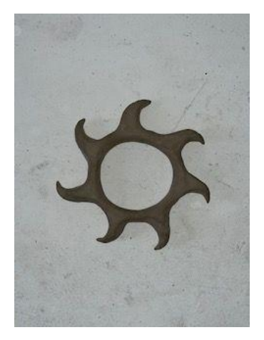
Soleil, clay, 2022, 200$

Dragon hair, clay, synthetic hair, 2022, 300$