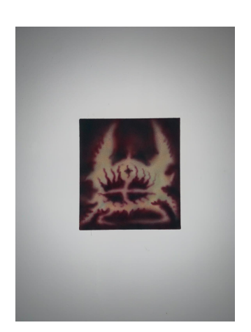
Untitled 1, Airbrushed Acrylic on canvas, $350