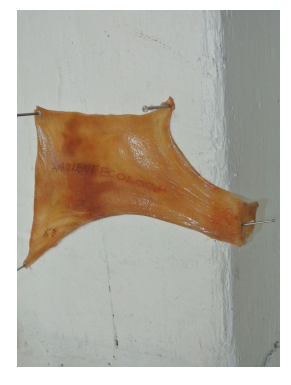
ancient ecology, pork hide, tattoo ink, cavicide, floor varnish, 2021, 19 x 30 cm. 333$