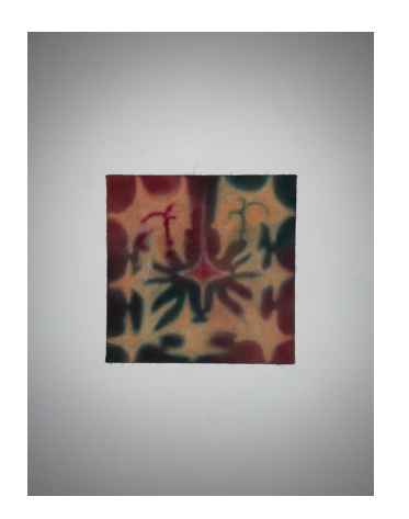
Untitled 3, Airbrushed Acrylic on canvas, $385