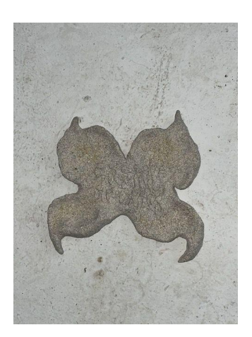
Embrace the chaos, clay, grog, 2022, 200$