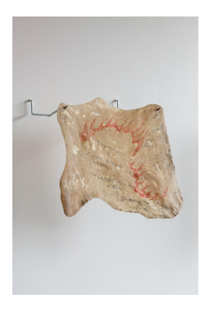
Gardienne de l'amour du monde , 2022. 17 x 26 x 12 in. Lamb skin, tattoo ink, chlorine based disinfectant, floor varnish. 3333$