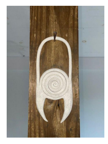
Angel legs, clay, 2022, 300$