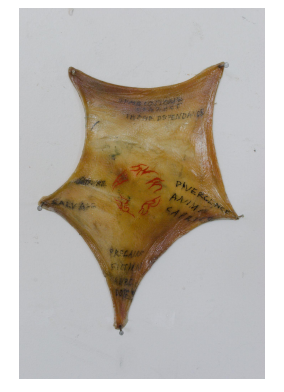
bring back pagan ways, pork hide, tattoo ink, cavicide, floor varnish, 2021, 36 x 25 cm. 555$